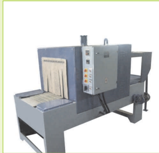
Shrink Wrapping Machine