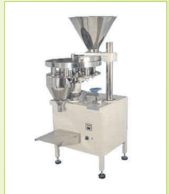
Volumetric Cup filler